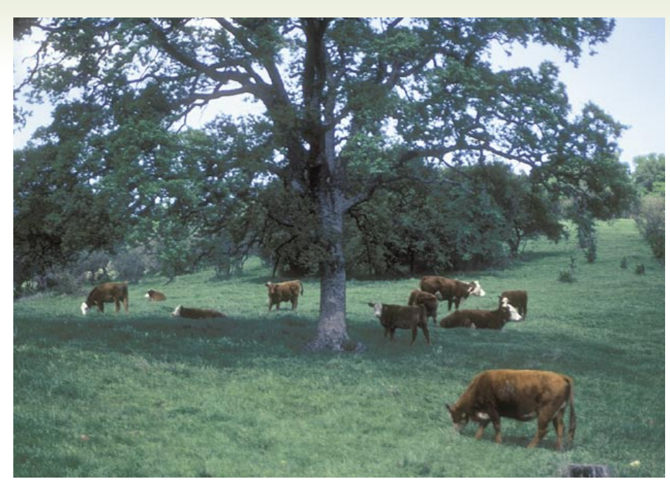
Most oak woodlands in California are privately owned and used primarily for grazing; however, livestock grazing is an important factor in the state's documented low rates of oak regeneration.

Describing the foothill oak woodlands in the Carmel Valley, White (1966) stated that "a prevailing characteristic . . . is the lack of reproduction . . . with very few seedlings." A survey of 15 blue oak