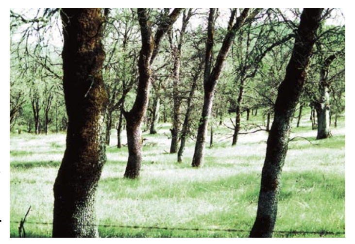
The poor natural regeneration of oaks, right, can be partially offset by careful management of grazing in woodland areas, coupled with protection for oak seedlings.