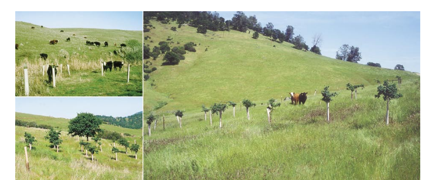
Tree shelters have proved effective in preventing cattle from trampling and grazing on oak seedlings. By the time oaks reach about 6.5 feet, they are generally able to withstand cattle damage in little- to moderately grazed pastures.

low-cost procedures for restoring oaks. Several of these studies have been conducted in areas grazed by cattle, with the objective of identifying how oaks can be established in grazed pastures without removing these lands from live-stock production. The question of how cattle and oaks can be raised together is important because more than 80% of California oak woodlands are privately owned (Ewing et al. 1988), with much of this land in livestock production.