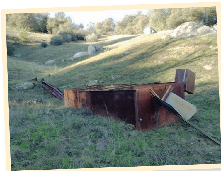
FIGURE 1. Remnant of the Veihmeyer flume near Ahwahnee, Madera County, California.