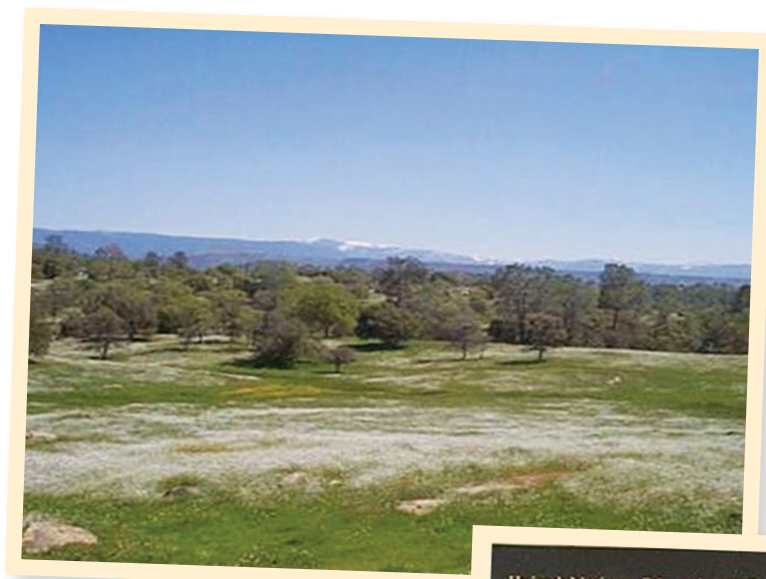
FIGURE 3. San Joaquin Experimental Range in Madera County, California.