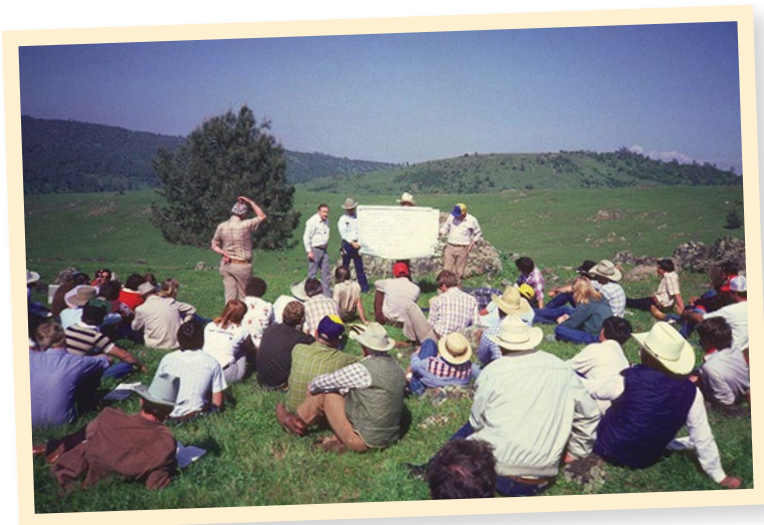
FIGURE 5. A field day on Forbes Hill at the Sierra Foothill Research and Extension Center in the 1980s.

Recognizing the need for a permanent sheep production and range research station, in 1951 UC established the 4,637-acre Hopland Field Station, now known as the Hopland Research and Extension Center (HREC), located east of the town of Hopland in Mendocino County. Al Murphy was director of the station from 1951 to 1986. Initially the site of sheep production and brush control studies, HREC would become the site of extensive studies of predator control, range seeding and fertilization, oak woodland ecology and management, habitat management, and, most recently, watershed and water quality research (Meadows 2001). In 1958 UC withdrew from the joint research program at San Joaquin Experimental Range. The beef cattle herd was maintained at UC Davis